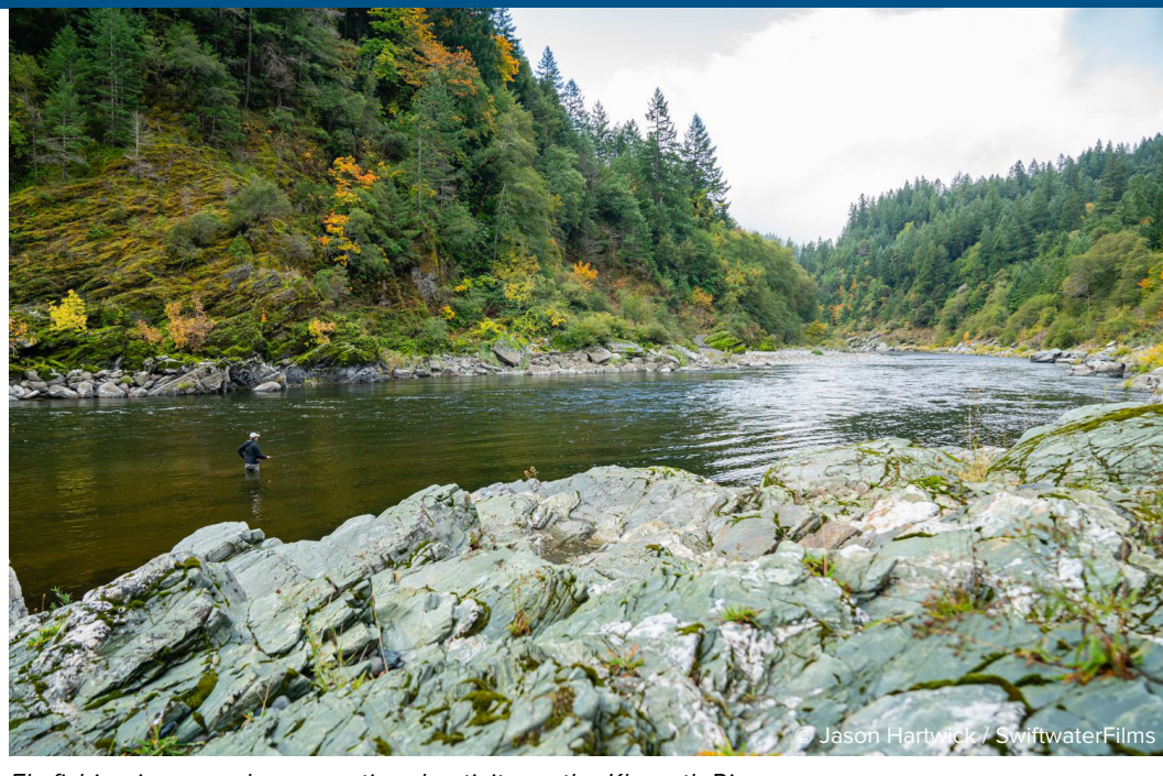
Fly fishing is a popular recreational activity on the Klamath River.

Klamath-origin salmon runs are critical to all ocean commercial and recreational salmon fisheries throughout northern California and southern Oregon, supporting thousands of rural, coastal fishingrelated jobs and bringing in hundreds of millions of dollars to coastal communities. But when Klamath salmon runs have been seriously depressed in