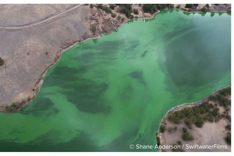
Toxic blue-green algae bloom in Iron Gate in 2021.

The Lower Klamath Hydroelectric Project was built between 1908 and 1962 by the California-Oregon Power Company. With no fish ladder on any of the lower three dams, the structures deny salmon access to hundreds of miles of historical spawning and rearing habitat. The dams disrupt transport of sediment, alter water temperatures, and create the perfect conditions for blooms of toxic blue-green algae. In 2002, the dams