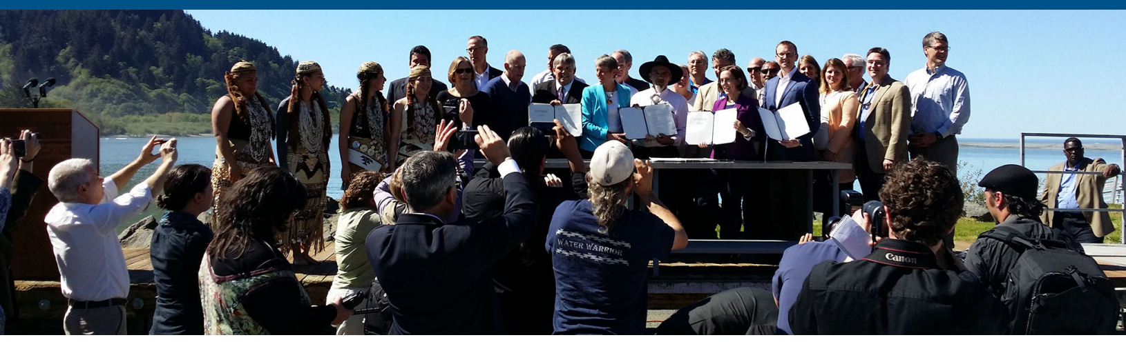
Signatories gather to sign the Amended KHSA in 2016