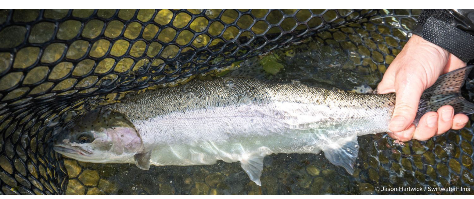
A steelhead trout, caught by a fly fisherman.

their abundance, as has happened much more frequently due to impacts of the dams, closures of whole ocean salmon fisheries under "weak stock management" constraints become necessary to protect these weakest stocks. The economic costs to salmon-dependent coastal communities of these periodic Klamath-triggered fisheries closures have been enormous.