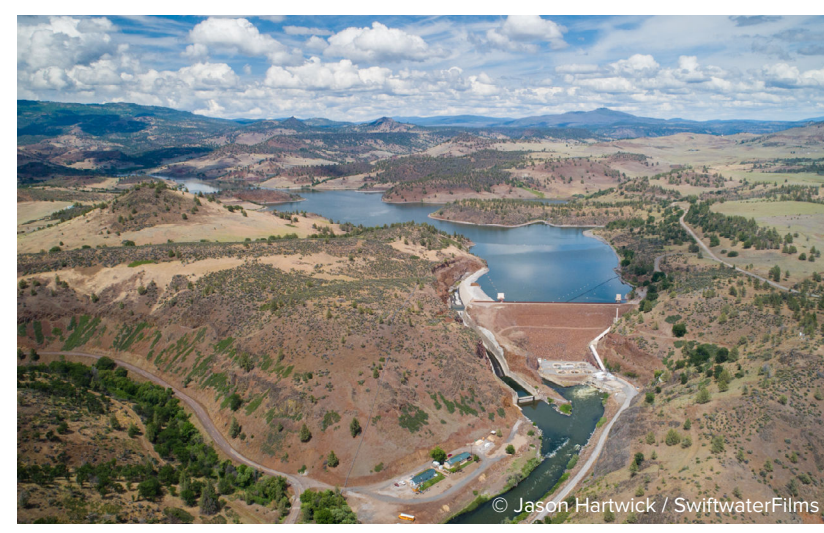
Iron Gate Dam

With no fish ladder on any of the lower three dams, the structures deny salmon access to hundreds of miles of historical spawning and rearing habitat. The reservoirs impounded by the dams allow water to warm to unnatural temperatures, impacting fish health by making them susceptible to disease, and propagating toxic algal blooms that are harmful to people and fish alike. The dams also starve the river of sediment, impacting ecosystems downstream.