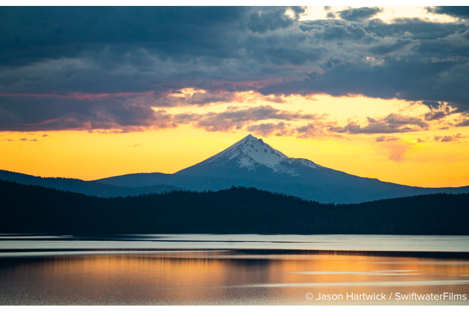
Upper Klamath Lake and Mount McLoughlin.

Karuk, Yurok, Shasta, Klamath and Modoc people have lived alongside the river and subsisted off its fisheries since time immemorial. Salmon remain a critical cultural and subsistence resource to the Indigenous people of the Klamath River to this day. Starting in the mid 1800s, resource extractive industries like timber and mining severely impacted both the landscape and Indigenous peoples of the mid-lower Basin. These industries also brought many other communities to the Klamath River. However, these